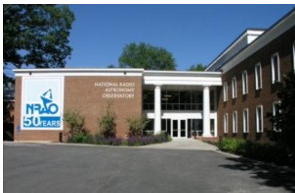
Stone Hall on the Campus of the University of Virginia and headquarters of the North American ALMA Science Center.

Each astronomer who uses ALMA is assigned an ARC for user support at the time they register with the ALMA Science Portal. Astronomers in North America, East Asia, or Europe are assigned to that region's ARC. Astronomers from Taiwan can select to use either the NA ARC or the EA ARC. Astronomers elsewhere in the world can select any one of the three ARCs.